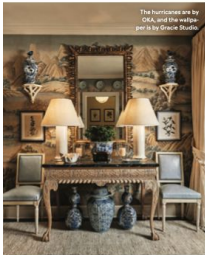
The hurricanes are by OKA, and the wallpaper is by Gracie Studio.

"It serves as a tonic for the rich reds in the tea paper," adds Hampton, noting the inherent rigor in its grid, a counterpoint to the room's sumptuousness. Below, how two of her fellow designers similarly turned dreamy destinations into main characters in their tableaux.