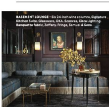
BASEMENT LOUNGE • Six 24-inch wine columns, Signature Kitchen Suite. Glassware, OKA. Sconces, Circa Lighting. Banquette fabric, Zoffany. Fringe, Samuel & Sons