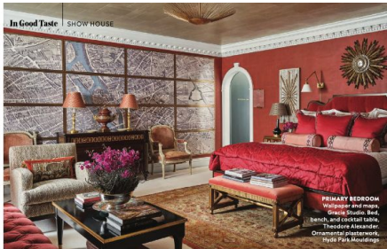
PRIMARY BEDROOM Wallpaper and maps, Gracie Studio. Bed, bench, and cocktail table, Theodore Alexander. Ornemental plasterwork, Hyde Park Mouldings