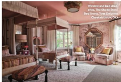
Window and bed draperies, The Shade Store. Bed linens, Yves Delorme. Chaise-throw, OKA