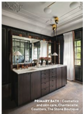
PRIMARY BATH • Cosmetics and skin care, Chantecaille Counters, The Stone Boutique

"I WANTED THIS ROOM to feel old, as if it was later converted to a bath with the bones of what once was," says Brant McFarlain, who modernized the layout with the help of a polished wood partition so functional areas are centralized rather than lining the walls. And paired with the custom plaster ceiling, traditionally utilitarian bath elements become sculptural centerpieces.