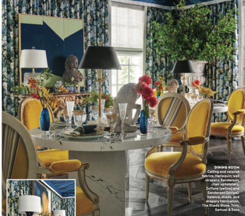
DINING ROOM Ceiling and valance fabrics, Harlequin; wall drapery, Sanderson; chair upholstery, Zoffany (yellow) and Sanderson (stripe). Valance, shade, and drapery fabrication, The Shade Store. Trim, Samuel & Sons

Is comfort the definition of luxury today? How designers at this year's Klips Bay Decorator Show House Dallas turned the spotlight on sophisticated ease and enjoyment of home.