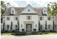
FRONT LANDSCAPING Houchard planted a series of columnar sweetgums to break up the white facade of the house and dotted the garden beds and parterre with azalea hedges, holly, and clipped boxwood. "They are durable plants with lots of contrast in texture and varying shades of green."