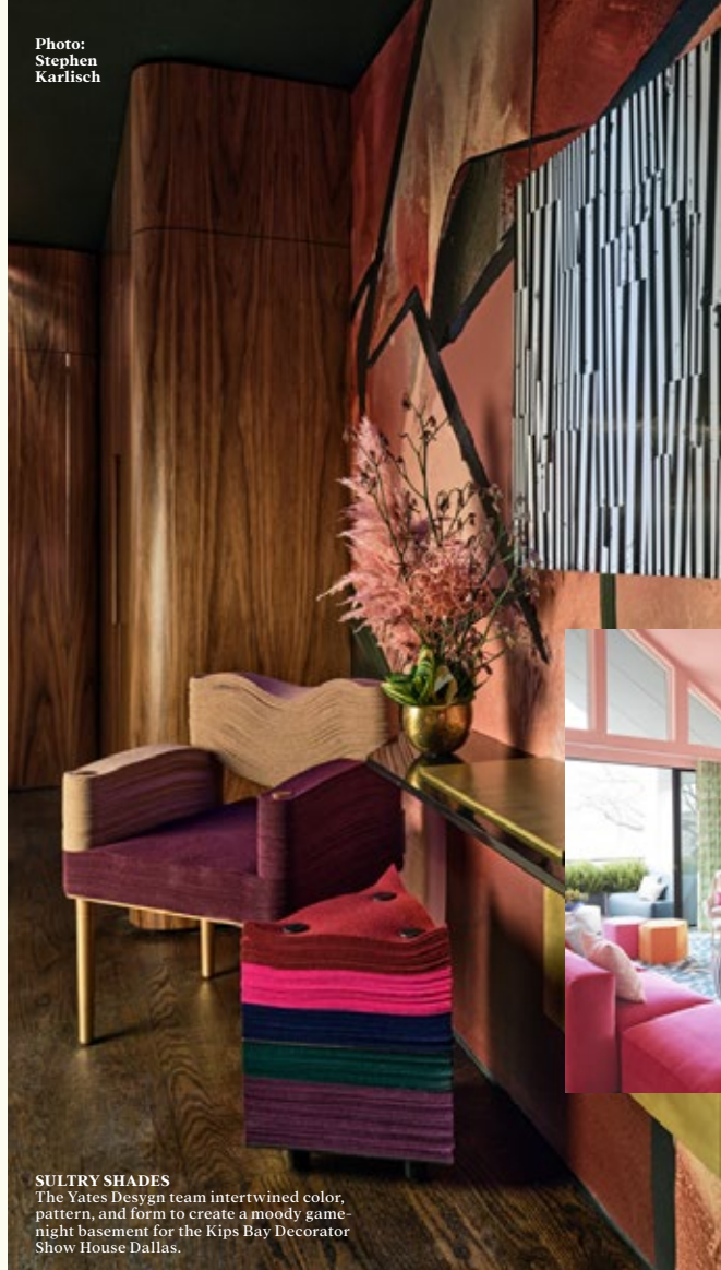
SULTRY SHADES The Yates Desygn team intertwined color, pattern, and form to create a moody game-night basement for the Kips Bay Decorator Show House Dallas.